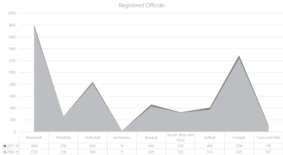
2018-19 Postseason Figures