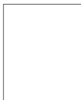
Dale Adams, Supt. Udall, USD 463 South Central Border