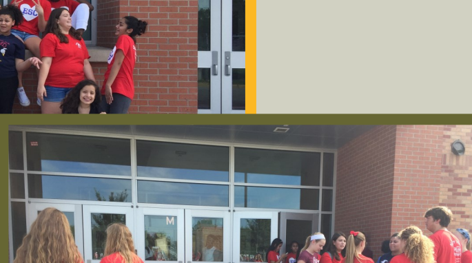
Olathe North Eagle Service Club decorated the sidewalks at school to add to the homecoming spirit and marched in the homecoming parade.