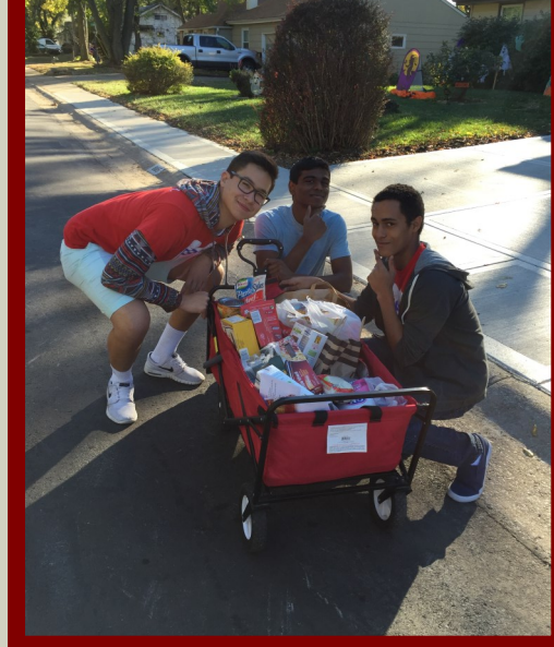
Eagle Service Club at Olathe North Trick or Treat So Others Can Eat – donated to Johnson County Christmas Bureau