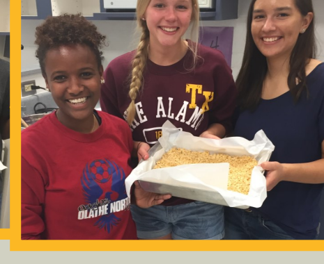
The Olathe North-Eagle Service Club made cookies with thank you notes for Teacher Appreciation.