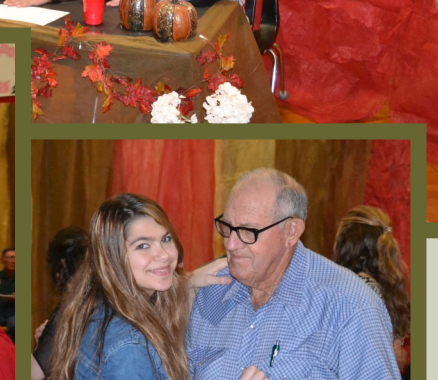
Haunted Halls & Junior High Halloween Dance hosted by Republic County KAY club on Halloween!