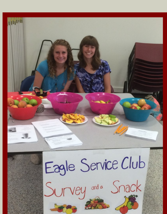
Olathe North's Eagle Service Club completing their Area 1 Project with an "Eat-This-Not-That" Survey and a Snack.