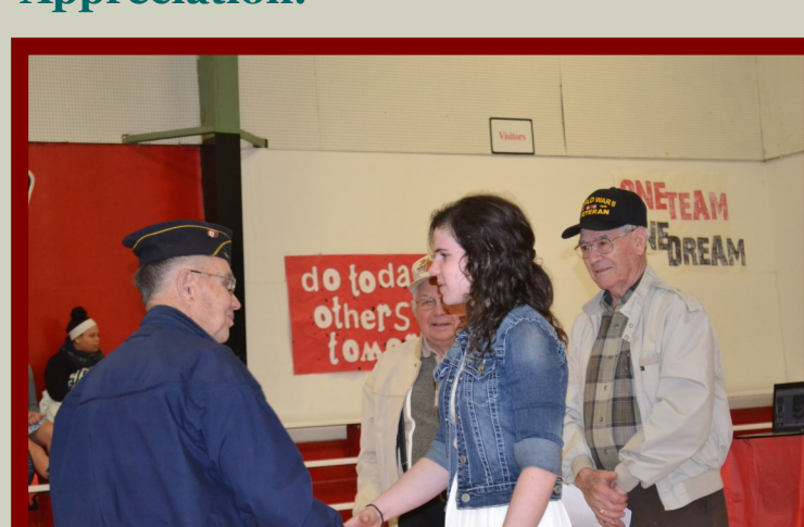
Wetmore High School KAY Club had a program celebrating the Veterans in their community.