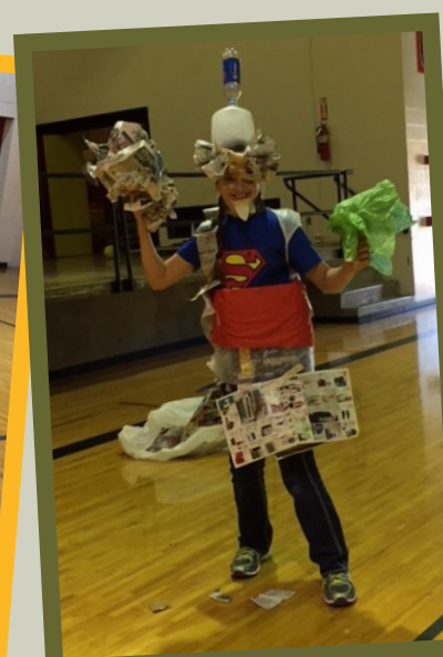
Chase County Junior High KAY Club made Halloween costumes out of recycled materials only as part of their Pumpkin Day Activities.