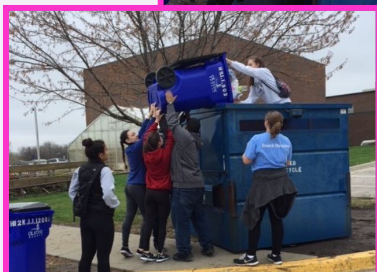
LANDSCAPING DAY FROM OLATHE SOUTH KAY CLUB. THEY WENT TO SCHOOL AND HELPED THE CUSTODIANS CLEAN INSIDE AND OUTSIDE OF THE SCHOOL.