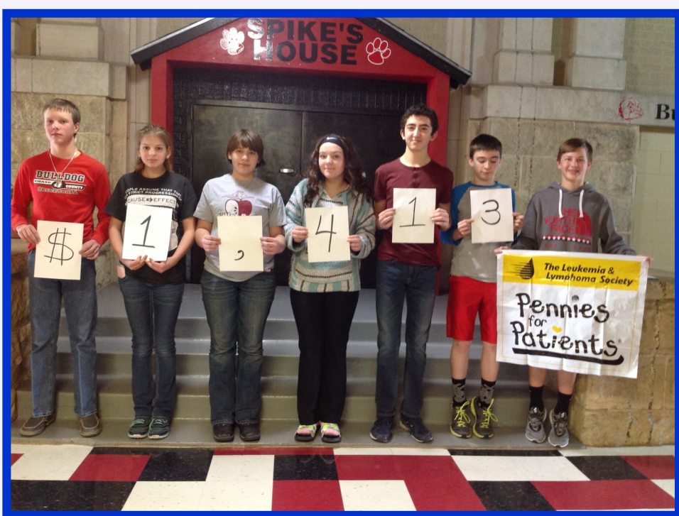
THE CHASE COUNTY JH KAY CLUB RAISED $1,413 FOR PENNIES FOR PATIENTS/LEUKEMIA & LYMPHOMA SOCIETY.