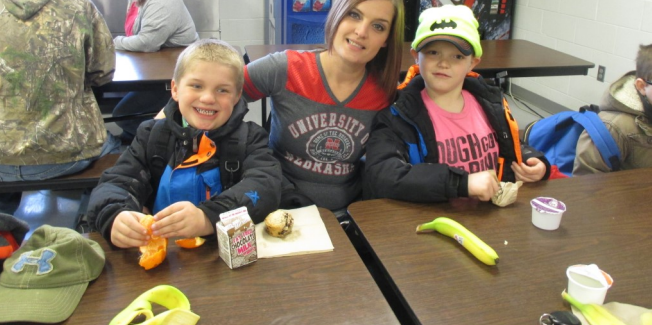
AXTELL HS KAY CLUB HAD A MUFFINS FOR MOM AND DAD EVENT. EVERY YEAR KAY CLUB SPONSOR DR. SEUSS WEEK FOR THE ELEMENTARY STUDENTS. THEY HAVE DIFFERENT DRESS-UP DAYS FOR EACH DAY OF THE WEEK AND HAVE MEMBERS OF THE COMMUNITY COME IN AND READ TO THE STUDENTS. THIS YEAR THIS DECIDED TO END THE WEEK LONG EVENT WITH MUFFINS FOR MOM AND DAD. WE OFFERED A FREE BREAKFAST TO ALL ELEMENTARY STUDENTS AND THEIR PARENTS. THEY SERVED MUFFINS, FRUIT, MILK, AND JUICE. THEY ALSO HAD A GREAT TURN OUT AND THE STUDENTS REALLY ENJOYED EATING WITH THEIR PARENTS.