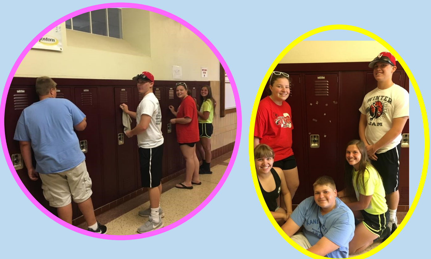
Hoisington HS KAY Club, a first year club is cleaning off the school lockers after school was let out in the spring.