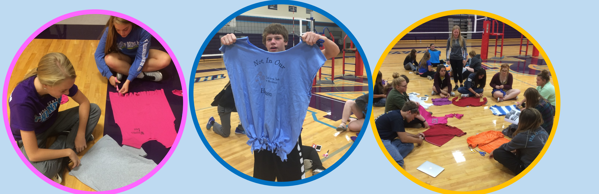
The Seneca-Nemaha Central KAY Club made t-shirt bags that they forwarded them to the Kids In Need Foundation in Wichita to be distributed with school supplies to needy kids.