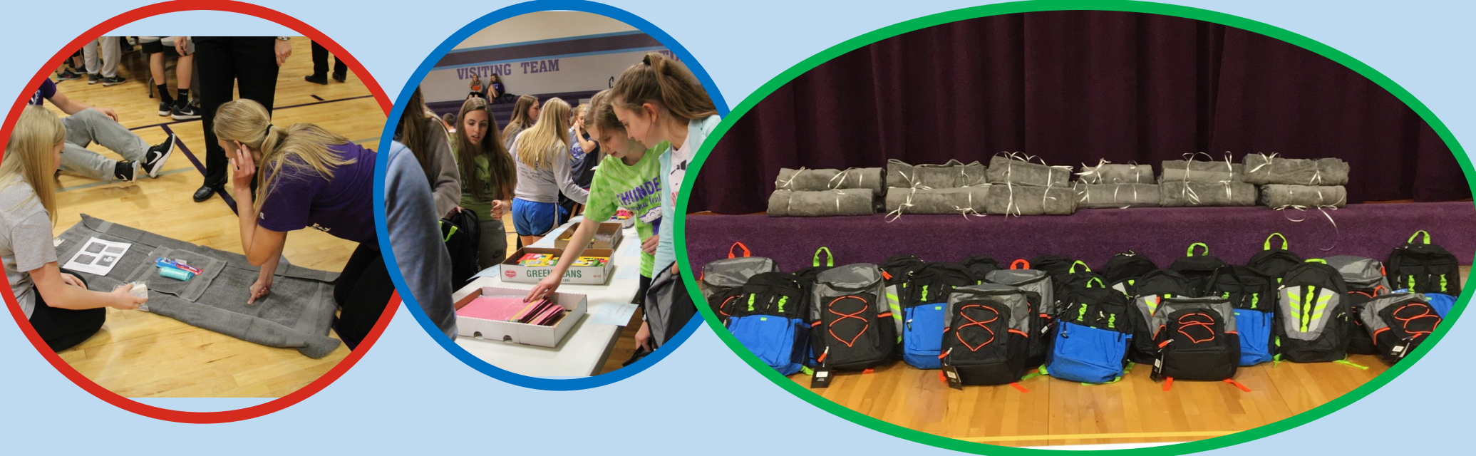
The Nemaha Central KAY Club made 22 school kits and 20 hygiene kits for their Spring Service Project. The kits will be sent to the Orphan Grain Train Organization which distributes medical, hygiene and school supplies to needy people across America and around the world.