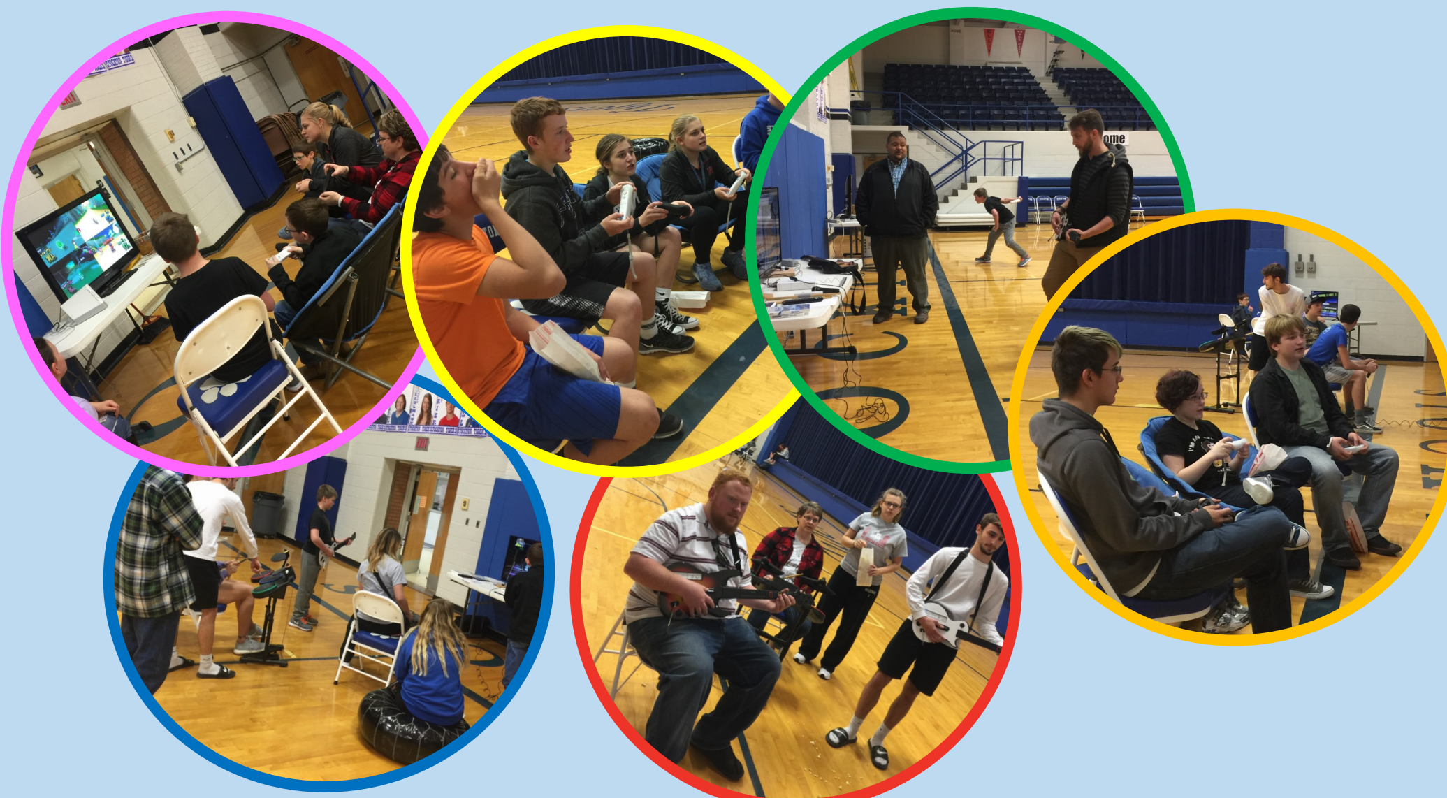
Stockton High School KAY Club helped raise funds for a student on dialysis.