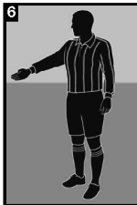
6 Penalty kick (Point to spot) Goal Kick (Point to goal area)