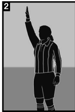
2 Indirect free kick (Hold until kick is taken and touched)