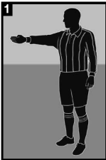
1 Direct free kick (Point in direction of kick)