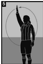
5 Wind-up to start clock