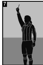
7 Caution/ Ejection