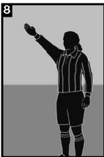
8 Corner kick (Point to corner)